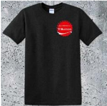
Location: Front. Apparel Color: Tweed Ink Color(s): White, Red