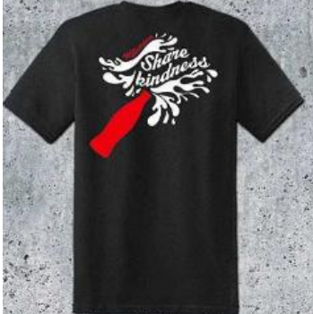
Location: Back Apparel Color: Tweed Ink Color(s): White, Red